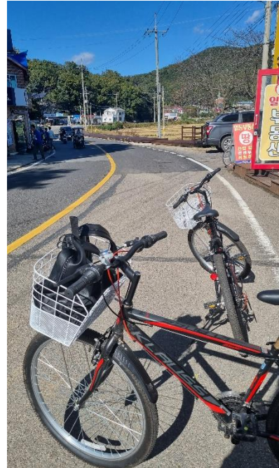
I went on a bike tour with friends to 신도, 시도, 모도 islands close to Incheon