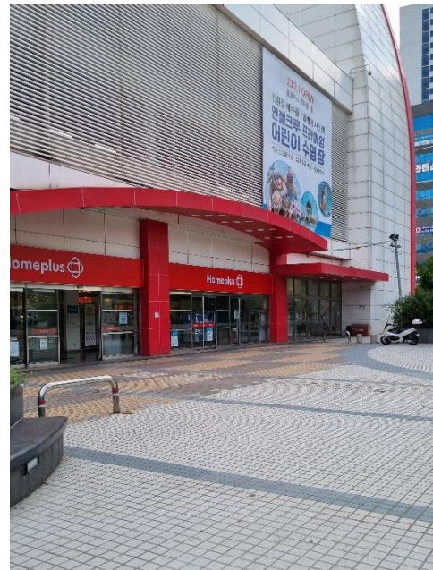
Homeplus at Inha front gate where you can find basically everything to buy