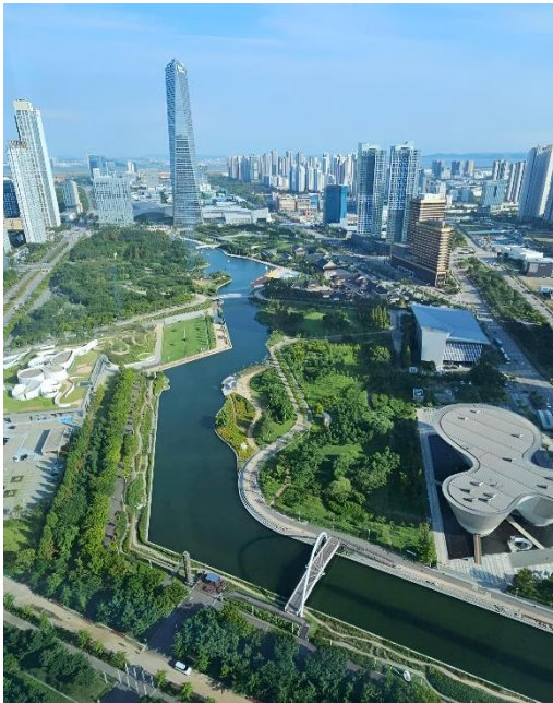
I went to Songdo G-tower!