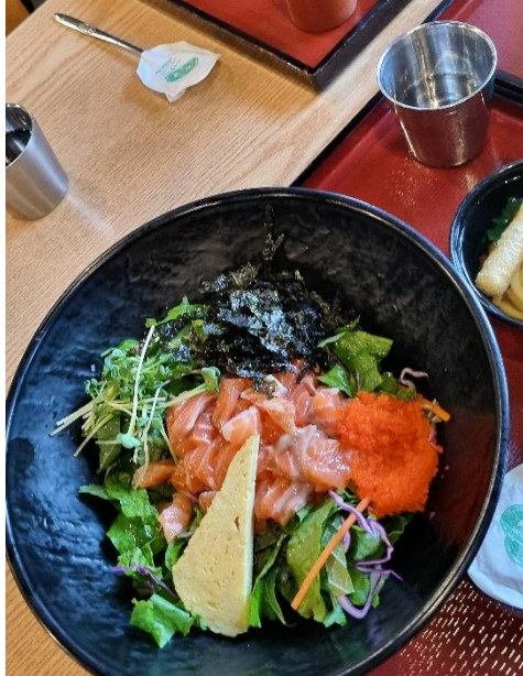
Salmon bowl at one of my favourite restaurants that I mentioned earlier (가메이)