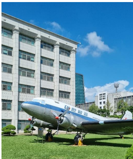
At first, I couldn't believe that there's a whole airplane on campus ground!