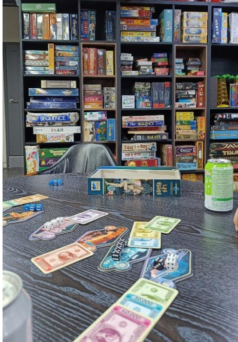
Board game cafés are really cool to spend time with friends!!