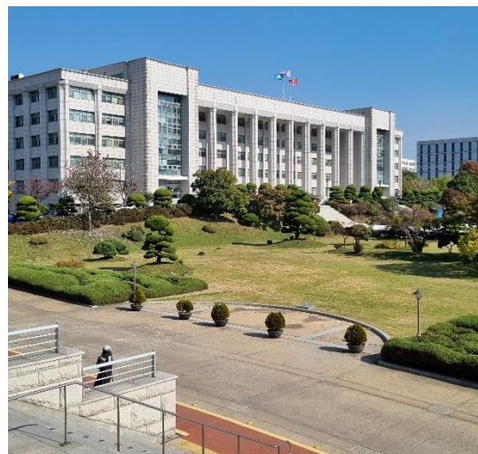
View of the main building from the library